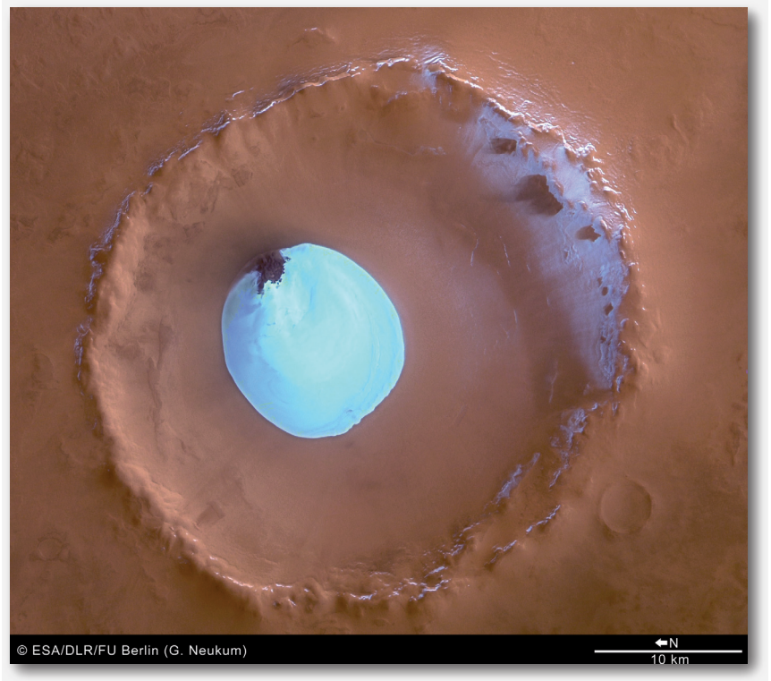
Figure 1. Waterworld : an unnamed impact crater located on Vastitas Borealis, a broad plain that covers much of Mars's far northern latitudes, at approximately 70.5° North and 103° East. The crater is 35 km wide and has a maximum depth of approximately 2 km beneath the crater rim. The circular patch of bright material located at the centre of the crater is residual water ice. Image taken on 2 February 2005 with the High Resolution Stereo Camera on The European Space Agency's Mars Express.

There is even mounting evidence that the large depression encircling the northern hemisphere of Mars once held a great ocean. The ground of the northern basin is much younger than that of the ancient southern highlands, and is curiously flat and smooth. Many of the giant outflow channels described above spill out into this basin, and it is clear